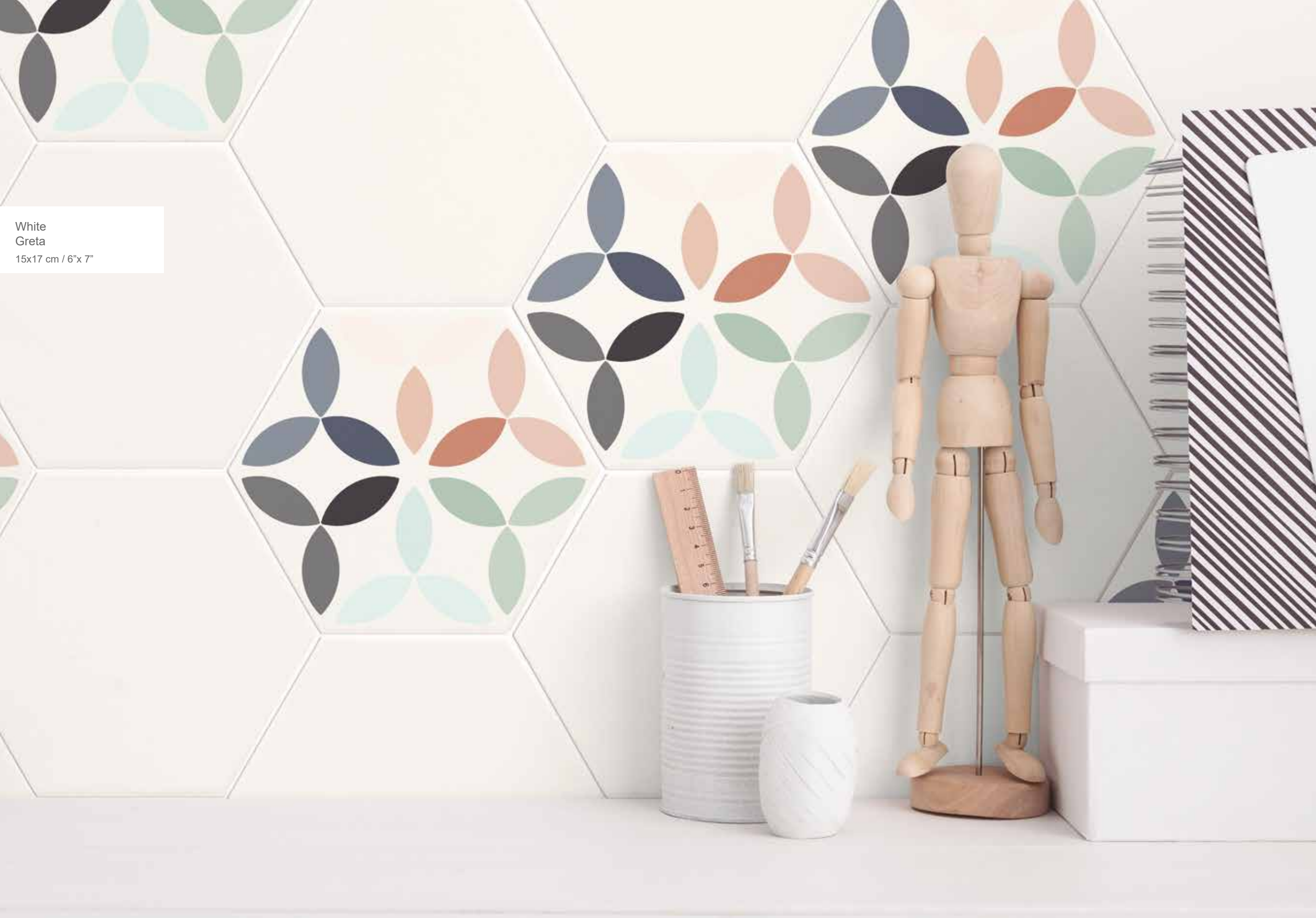
White Greta 15x17 cm / 6"x 7"