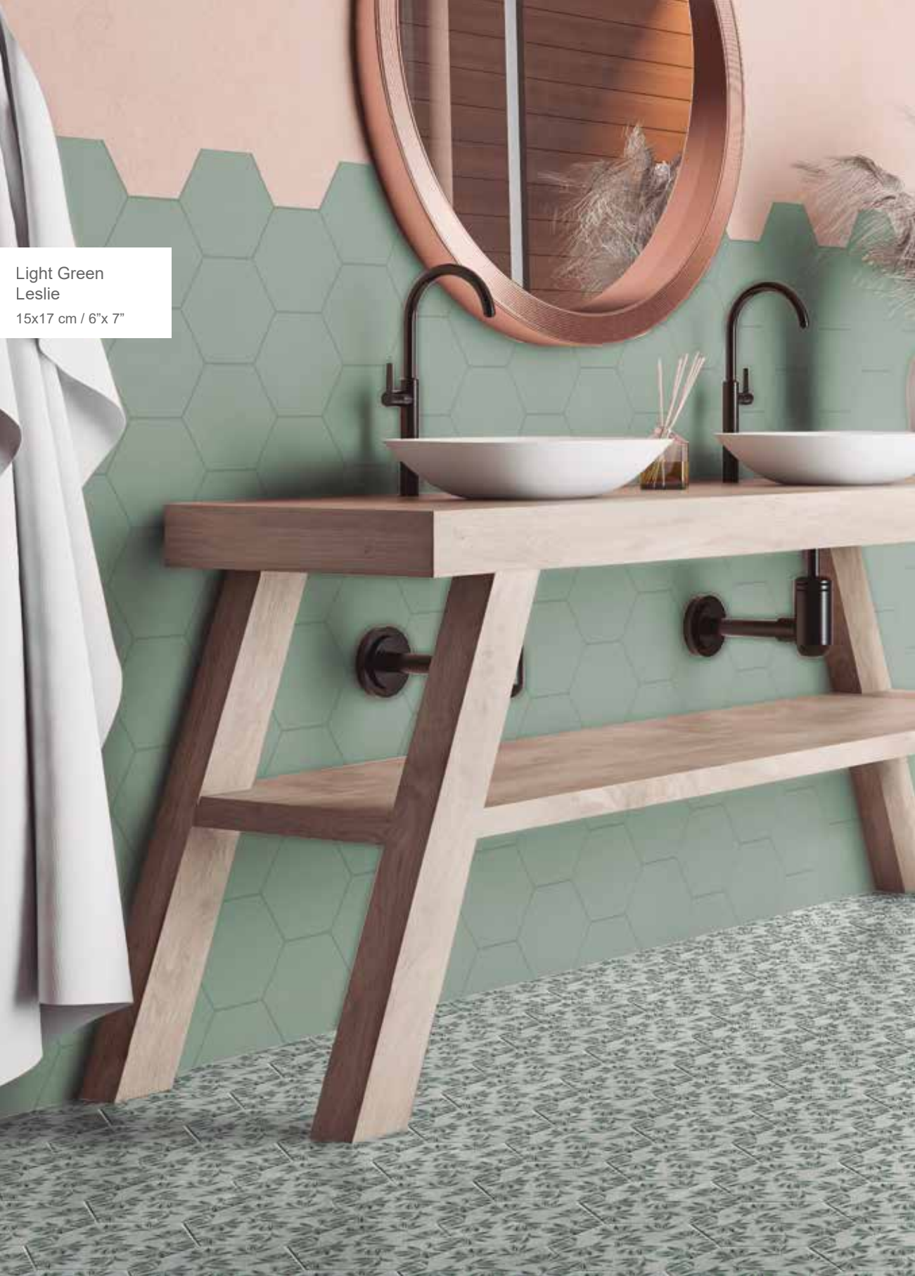
Light Green Leslie 15x17 cm / 6"x 7"