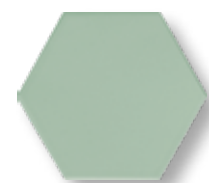
E235905 Light Green