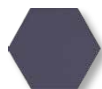
E235907 Dark Blue